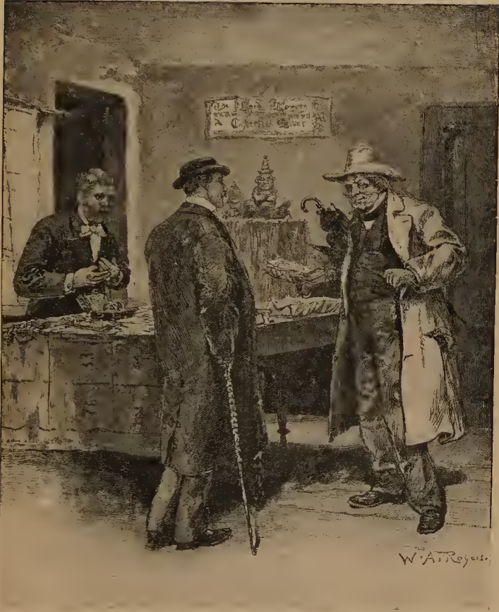
“TO MAKE FOUR HUNDRED DOLLARS CLEAR”